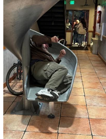
New Belgium Brewery Tour and Member Participation