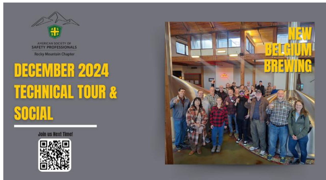
ASSP Rocky Mountain Chapter